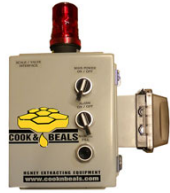
Electrical Interface Box (shown with alarm)