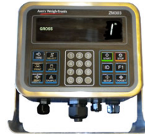
Scale Display/Control Panel